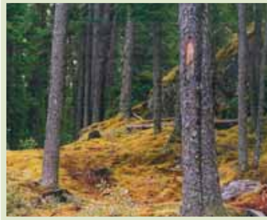
A blazed tree marks the portage.

While paddling this park you can retrace the fur trade routes of the historic Hudson Bay and Northwest Companies or paddle a chain of lakes to places where few have ever passed. Woodland