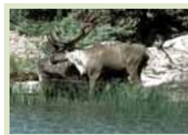
Woodland Caribou.

The Woodland Caribou Park is a unique mix of boreal and prairie ecosystems. The dry climate, well-drained plateau topography and proximity of the prairie have all contributed to a unique forest mosaic. In its complex