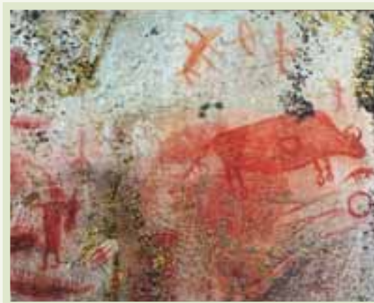
Artery Lake picture writing site dates back 1,000 years.

The rewards of this wilderness are found on stone. Onamin or wunnamin are Ojibway words for red ochre, a chalky red mineral that was mixed with animal and fish oils and used by the shaman to record their stories of power, medicine and celebration. These picture writings are found on rock faces throughout the park and considered to be spiritual sites. (See our book review, page 5).