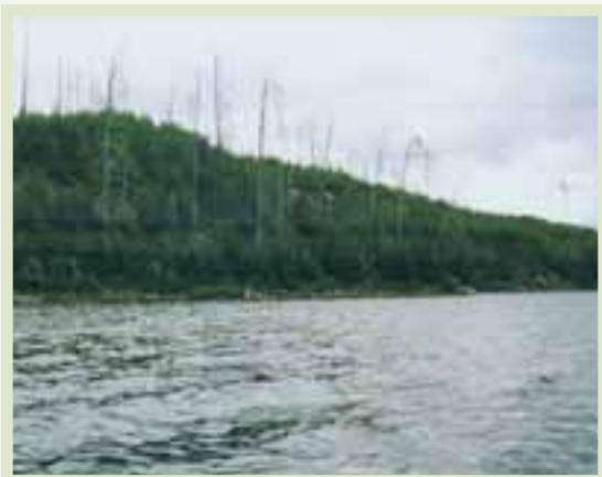
New forest takes root 15 years after wildfire, Bulging Lake.

The Woodland Caribou forest is a mosaic pattern of fire succession. The park has never been logged, however, half of the park has burned within the last 30 years. Paddle any canoe route within this park and you will pass by forests in every stage of fire succession—from the black and soot of recent burns, to the sudden and colorful profusion of herbaceous growth that flourishes after a fire, to the slow return of a mature forest of jack pine or spruce. The ashes of the forests past are the soils that sustain forest renewal today.