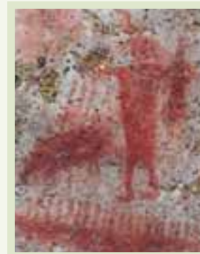
A Shaman holding an otter medicine bag. Power lines radiate from his head, Bloodvein River.

They say that when you pass by a pictograph in the Woodland Caribou Park to paddle slowly and quietly— "maybe you'll hear a murmur or chant; the song of the healer resonating in the depths of your wilderness".