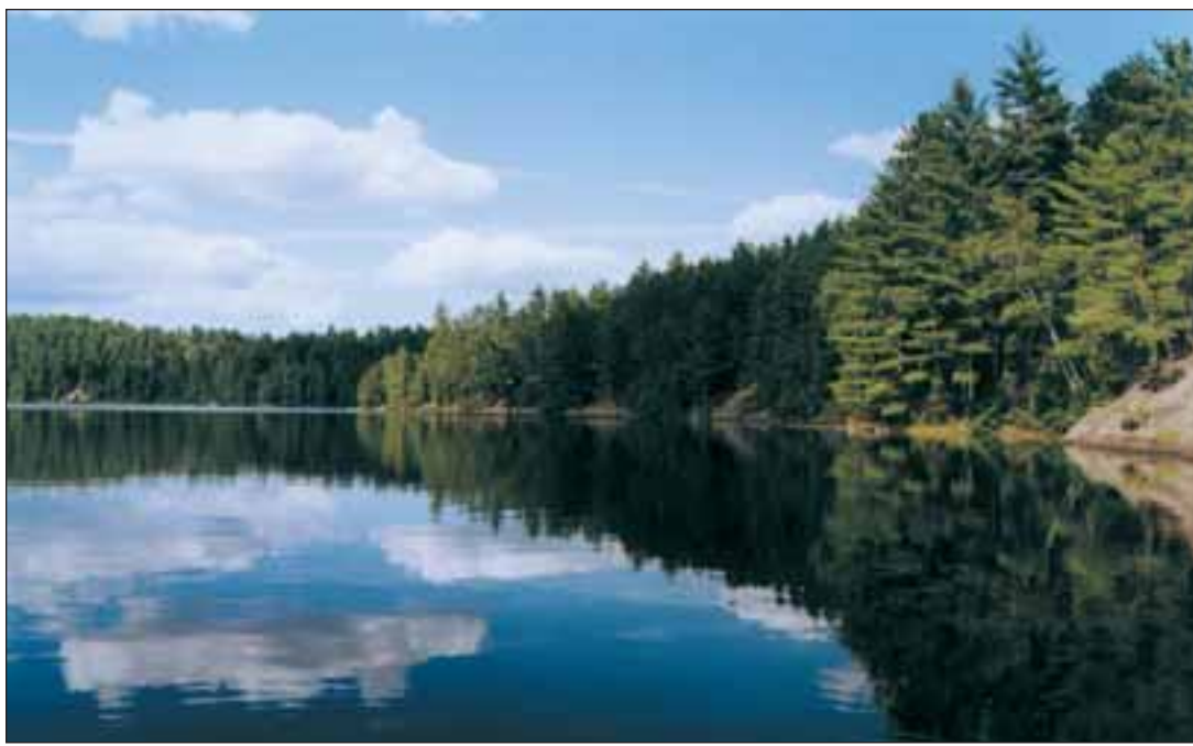
Burntside Lake easement viewed from East Twin Lakes.