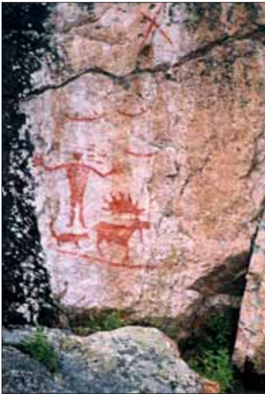
Hegman Lake Pictographs, located 15 miles northeast of Ely, MN on the Echo Trail.

These historic native illustrations are thought to be some of the clearest examples of pictographs in the BWCA/Quetico wilderness.