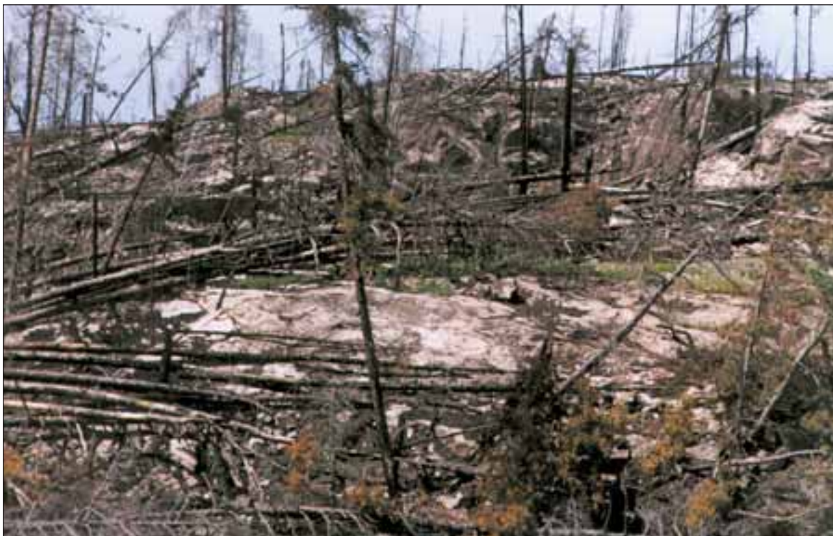
Three Mile Island, Seagull Lake, June 20, 2003.