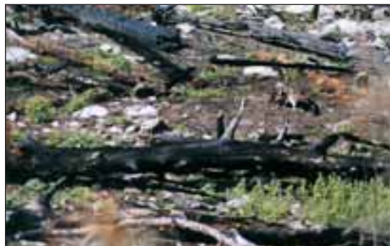
New growth on Three Mile Island is beginning to pop up.

A group of researchers and Forest Service personnel looked at the burn in mid-May. Already there was quite a bit of vegetation coming up. The fire released a lot of nutrients back into the soil, which results in quite a bit of new vegetation out there. Most of the vegetation is herbaceous this year.