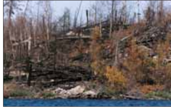
South shore of Three Mile Island.

By the fifth year, the aspen will be 4-6' tall, the jack pine and red pine around 1', and the grass, herbs and woody shrubs will disappear in the shade of the young seedling trees.