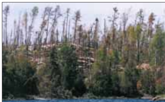
East shore of Three Mile Island.