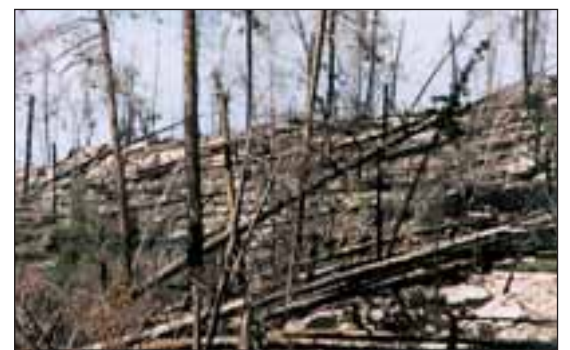
East shore of Three Mile Island.

We also learned that we can mimic natural fires with prescribed burning, creating mosaic burn patterns. This means our effects would not be outside of what would naturally occur.