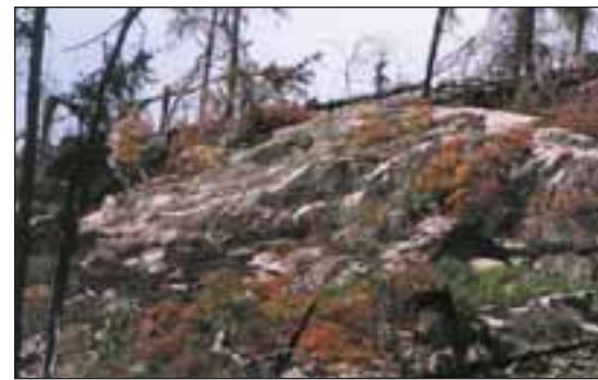
Barren rock outcropping on Three Mile Island.

Incidentally, just this spring we had another fire on one of these islands and the entire island burned.