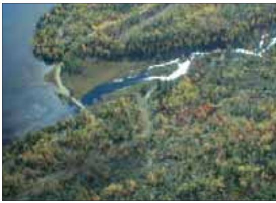
Aerial view; confluence of Cross River and Gunflint Lake.