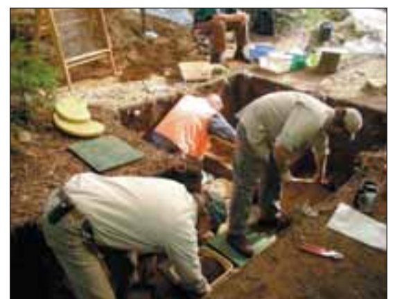
The Heritage Program's 2004 excavation of Gordon's Site.

The thousands of artifacts recovered so far are testimony to the day to day lives of a people now lost to time... At least part of this story is played out at the Gordon's Site from the Late Paleo-Indian to the Archaic.