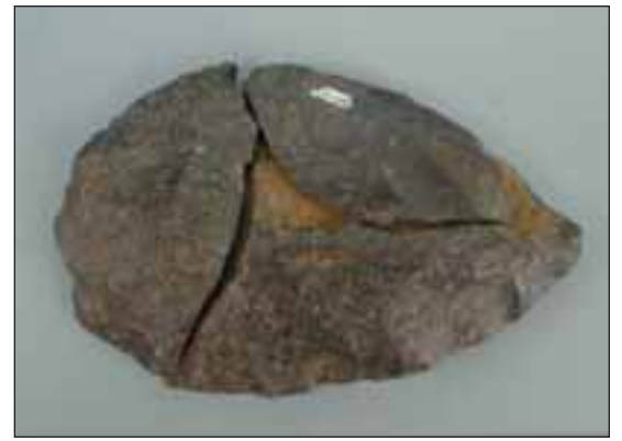
Large Biface Knife, 11cm in length, circa 7,000 to 3,000 BC.