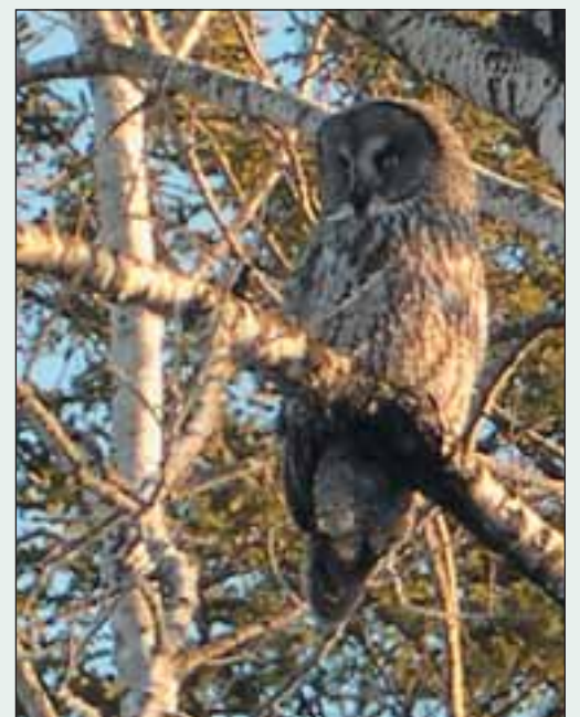
A Great Gray Owl seen in Aitkin Minnesota, February 2005.

University of Minnesota Raptor Center http://www.raptor.cvm.umn.edu/