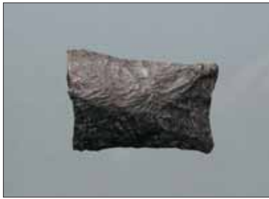
Paleo-Indian period artifact, 4cm in length. Circa 10,000 – 7,000 BC.