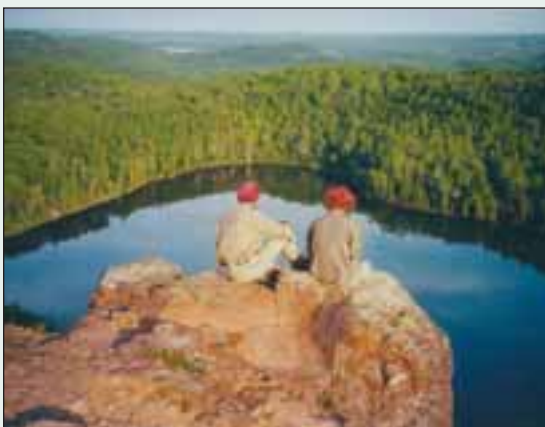
Trail overlook at Bean Lake near Silver Bay.

The SHT, which has earned accolades from Backpacker , Prevention , and Reader's Digest , stepped into being with a burst of construction in the late 80s and early 90s. Grants from the Legislative Commission on Minnesota Resources totaling more than a million dollars provided a trail construction coordinator on loan from the DNR and pay for trail workers, including laid-off LTV Steel employees. The SHT officially opened – with a ceremonial log-cutting, no less – in 1987. By August 1990 140 miles of trail were completed.