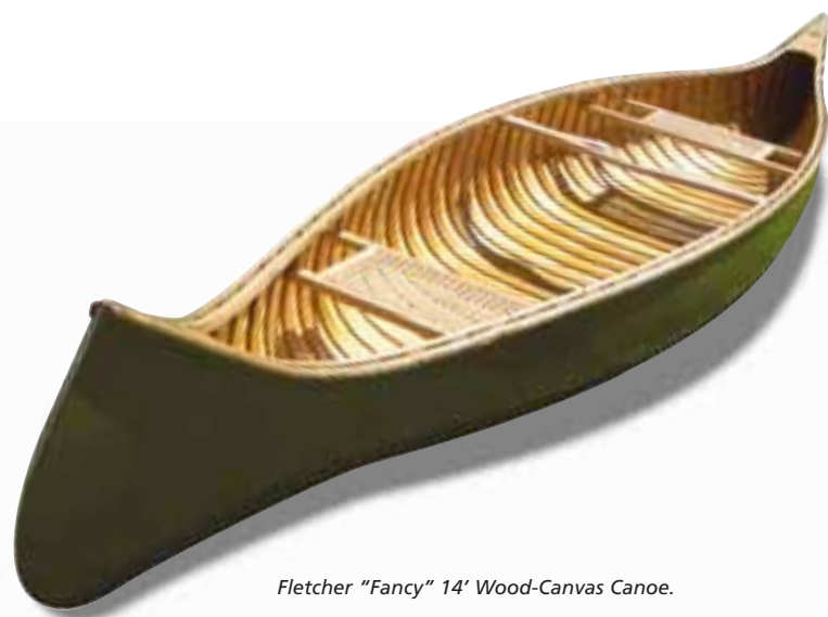
Fletcher "Fancy" 14' Wood-Canvas Canoe.