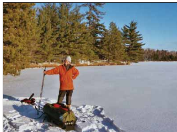
The author on the winter trail.

And a quinzee hut to build, if you're of that ilk. I've tent-camped in winter, bivy-sacked on the ice, and coveted those trapper-style wall tents with their woodstoves and warmth, but I enjoy the simple, caveman pleasures of the quinzee the best.