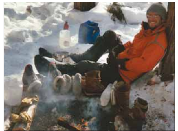
Drying footwear, enjoying life.

Hey friend, pass me another ice cream bar.