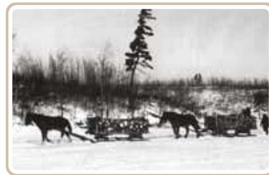
Hauling logs over the ice to build cabins near Winton, MN, 1926.