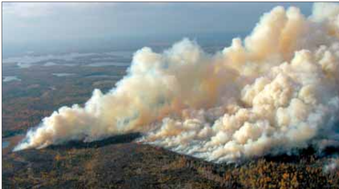
Kekekabic prescribed burn.