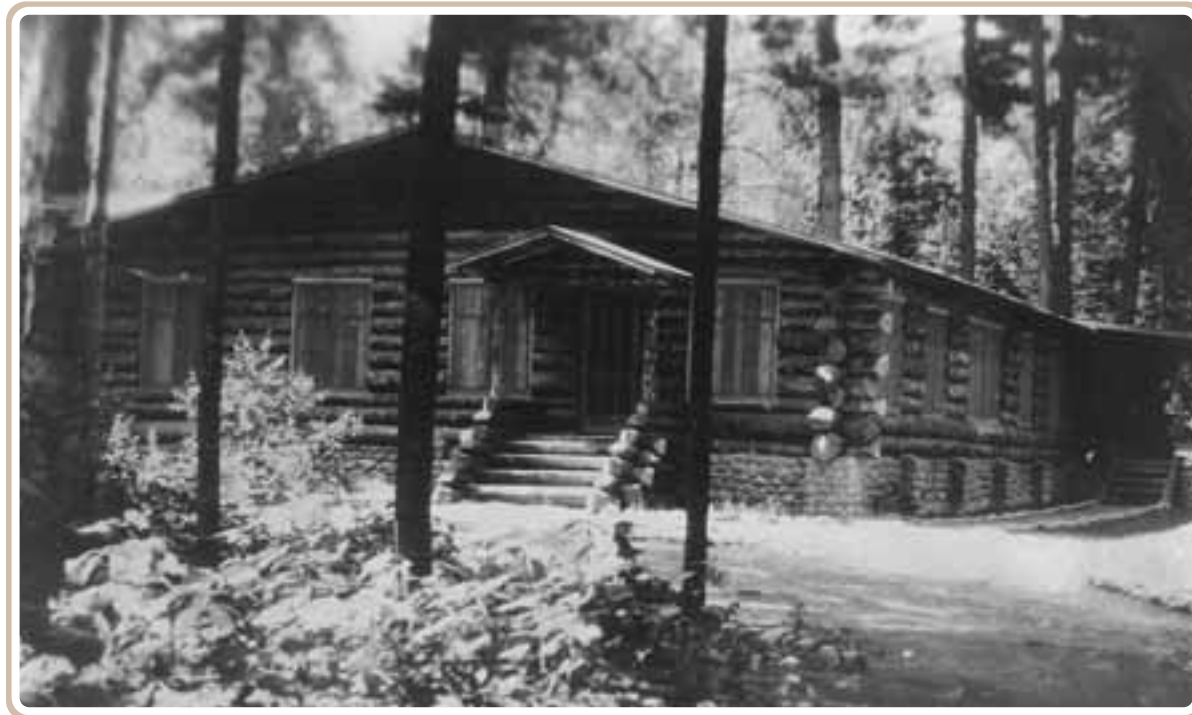
Basswood Fishing Lodge, Basswood Lake near Ely, 1933.