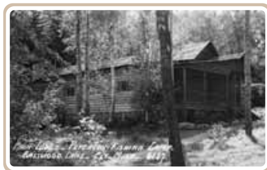
Main lodge at Peterson Fishing Camp, Basswood Lake near Ely, 1943.

The 1900s-1920s signalled rapid change in the northwoods of Minnesota— railroads brought a booming logging industry, roads were built, and the population surged with the demand for lumber. Yet, while commercial interests gained speed, a public concern for protecting the border lakes from industry was also rising. The Superior