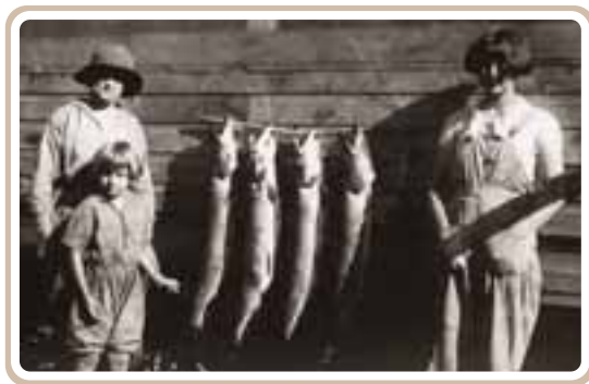
Catch of the day at Wegen's Wilderness Camp, Winton, MN, 1925.