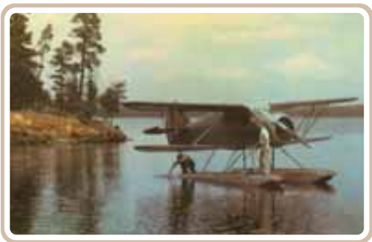
Postcard, men fishing from from a seaplane, 1945.